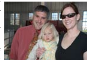
The Prez & Co.

I hope you are enjoying the great weather outside in New Haven's first class park system. Although we live in a city, New Haven residents are never that far away from the beauty of the natural world. We owe this to urban planners who had the foresight to set aside great tracts of public land so close to our urban center. In fact, there are some vistas in our fair city that are so stunning, they compare favorably to views in some national parks. I would like to list my five favorite vistas in the New Haven park system, in no particular order.