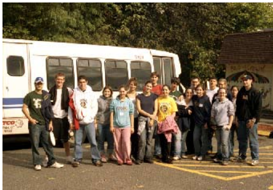
Quinnipiac University CAP students

Organized by the WRNP Friends Group and with the assistance of the Community Action Project (CAP) program from Quinnipiac University, over forty giant garbage bags of litter and debris were collected