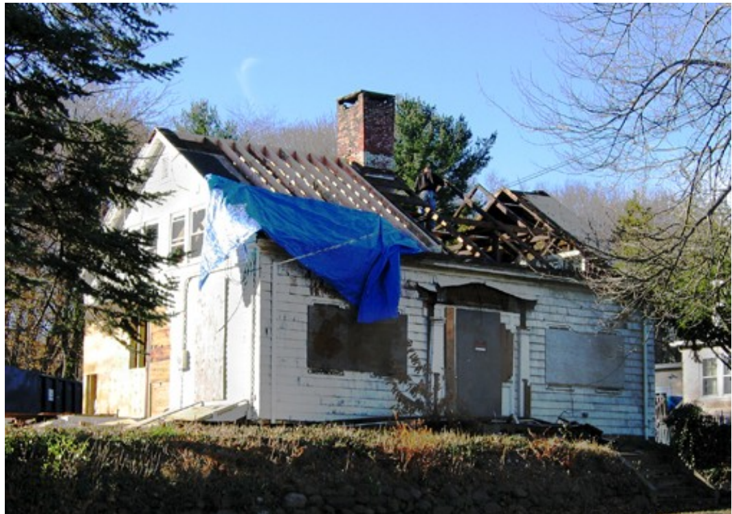
324 Townsend Avenue. This colonial era building is being structurally reinforced and secured for future restoration. The Historic District Commission worked with the Parks Department on an historic structures assessment to document the essential elements of the building and to identify the historic core for preservation.

Formally noticed discussions were held and affirmative recommendations were made on the nomination of one property to the National Register of Historic Places.