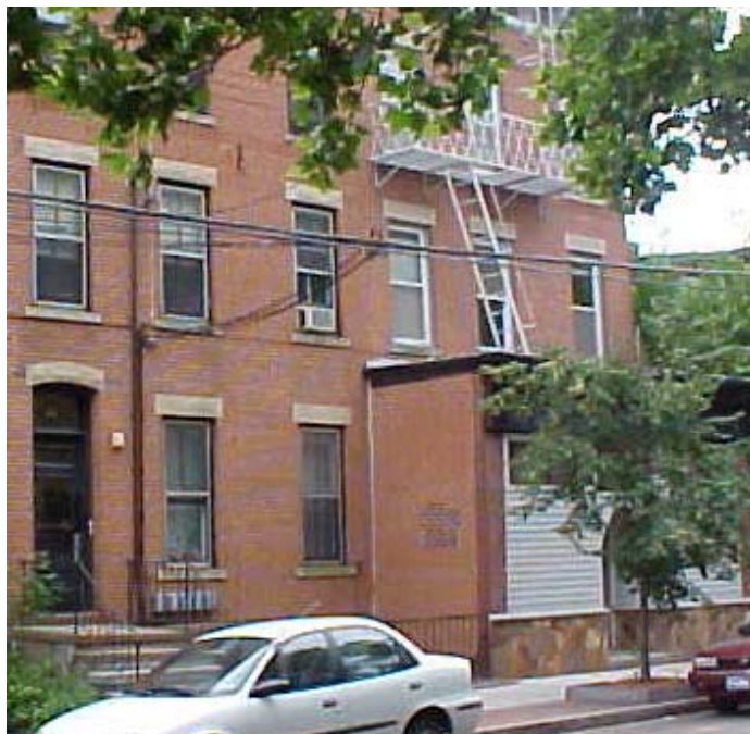
The Board of Zoning Appeals granted a special exception for a neighborhood convenience use, allowing for the reopening of this vacant storefront as the Wooster Tub laundry.