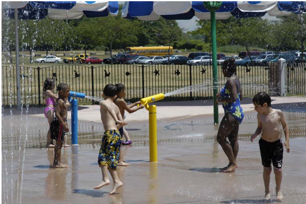
Lighthouse Park Splash Pad.

In addition, general repairs and replacements were done to various park fences.