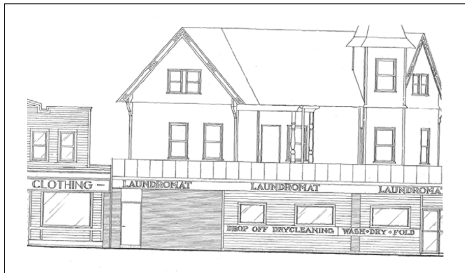
Kimberly Square. The City Plan Department prepared conceptual renderings for the Kimberly Square project and provides technical assistance to applicants.

Commercial Façade Program. City Plan staff is appointed to the Design Review Committee of the Commercial Façade Program. City Plan design expertise (including an in-house architect) ensure quality, lasting designs that complement the building(s) and contribute to the overall fabric of the commercial area. Staff often provides both verbal comment and on-paper design for use by the grantee. Approximately 80 designs have been reviewed to date, including approximately 22 in 2004.