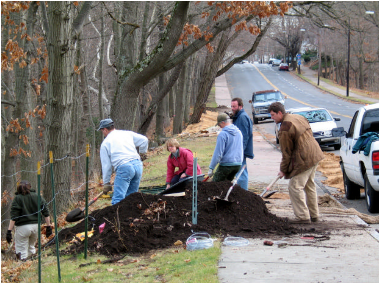
December in Edgewood Park: plans and practice.