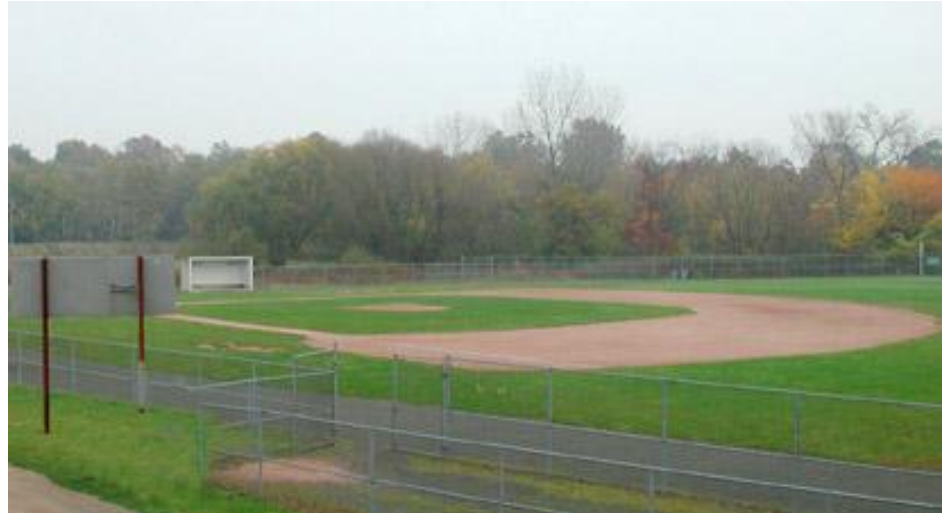
Bowen Field Baseball Diamond

To find out more about activities at Beaver Ponds Park, please contact the Parks Department for the City of New Haven: 946-8027