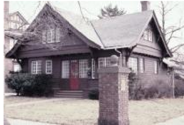
Beaver Hills Historic District

Anyone with an interest in the safety and quality of life in their Community Policing District should attend!