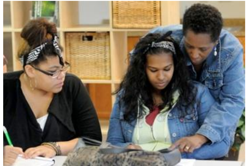
Higher Heights Youth Empowerment Programs, Inc.