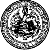
JOHN DESTEFANO, JR. Mayor

165 CHURCH STREET • NEW HAVEN • CONNECTICUT 06510