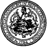
JOHN DESTEFANO, JR. Mayor

165 CHURCH STREET • NEW HAVEN • CONNECTICUT 06510