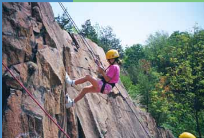
One of our own Awesome Adventurers!

$90 per two-week session for non-residents