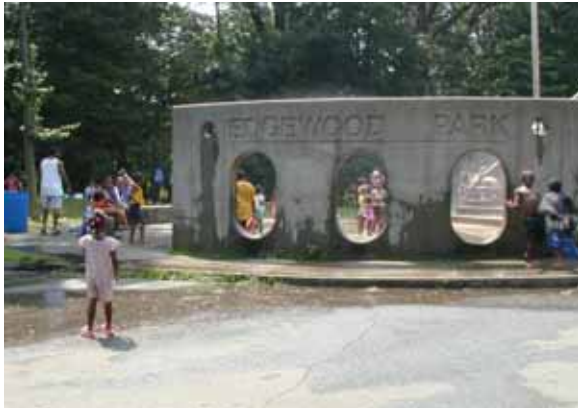
Cooling off In Edgewood Park

Children should wear comfortable clothing. Shorts, a T-shirt and sneakers are mandatory. The camp will provide your child with two camp T-shirts that must be worn on trips or for special activities. Your child should bring a bathing suit (boys must wear netted swim shorts), swim cap and towel to camp every day . Water shoes are recommended but optional. Sunscreen, insect repellent and water bottles are strongly recommended. For safety, footwear is limited to closed-toe shoes only.