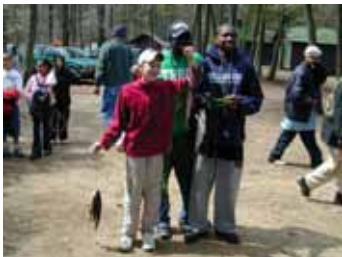
Big Fish at Camp Cedarcrest

Mill River launch site: corner of Orange and Cold Spring St./ Quinnipiac River launch site: Clifton St, near Quinnipiac Ave./ West River launch site: West River Memorial Park, corner of Ella T. Grasso Blvd, and route 34 / Morris Creek launch site: Lighthouse Point Park, near the bus turn around in the SE corner of the park/ Lake Wintergreen: West Rock Ridge State Park, entrance at the end of Main St. in Hamden