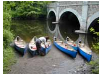
Reflection before a Canoe launch at the Mill River

Mill River launch site: corner of Orange and Cold Spring St./ Quinnipiac River launch site: Clifton St, near Quinnipiac Ave./ West River launch site: West River Memorial Park, corner of Ella T. Grasso Blvd, and route 34 / Morris Creek launch site: Lighthouse Point Park, near the bus turn around in the SE corner of the park/ Lake Wintergreen: West Rock Ridge State Park, entrance at the end of Main St. in Hamden